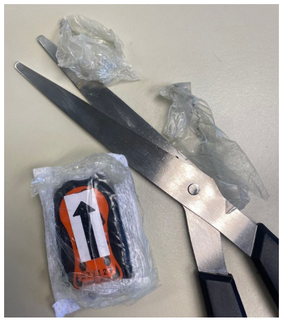
To re-adhere to your leg, repeat steps 2-6 of the instructions.